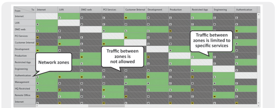
Tufin's Security Zone Matrix – simplified, centralized baseline to control your network security policy management

Understanding and enforcing network segmentation is a major challenge for IT experts. Tufin's Security Zone Matrix simplifies this task by visually mapping the desired network zone-to-zone traffic flow and instantly providing detailed insights on your network segmentation, including what services are allowed between different network zones and zone sensitivity across physical, virtual and hybrid Palo Alto networks.